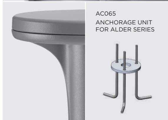
AC065 ANCHORAGE UNIT FOR ALDER SERIES