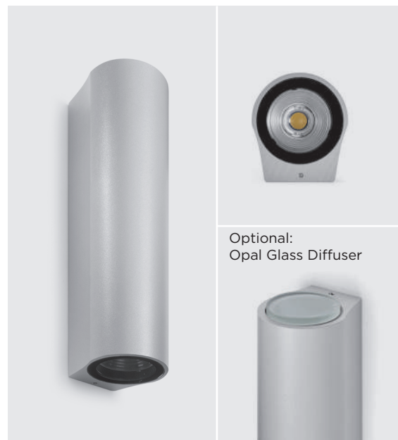
Optional: Opal Glass Diffuser