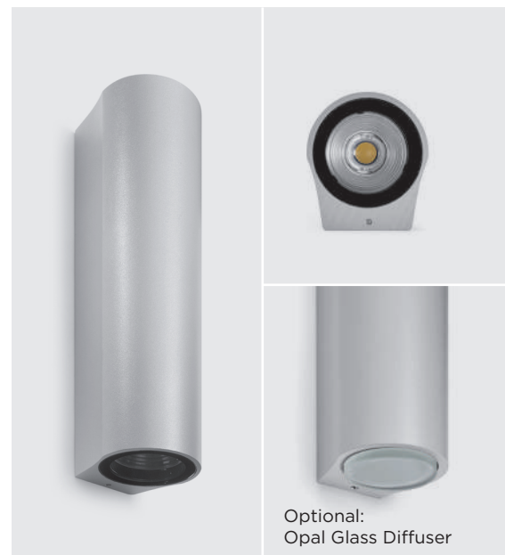
Optional: Opal Glass Diffuser