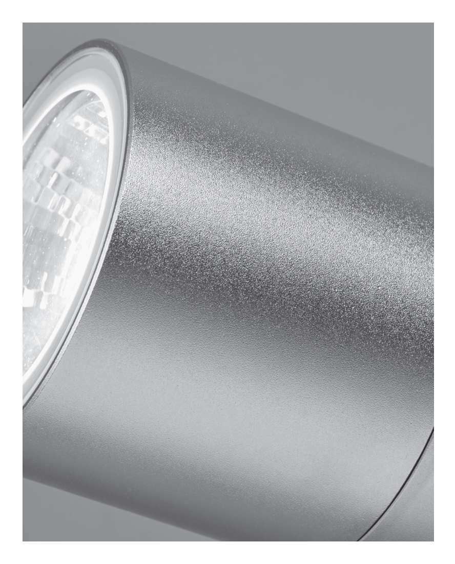
puk.it | 131