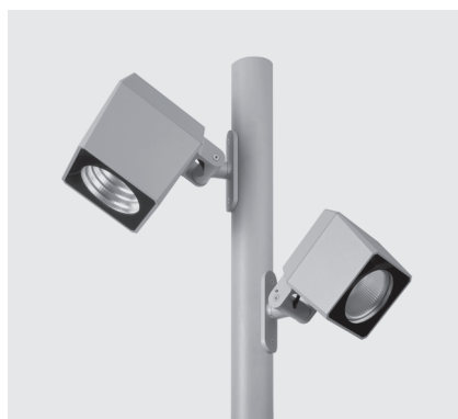
LUMINAIRE SUITABLE FOR POLE MOUNTING IN SINGLE OR MULTIPLE COMBINATIONS