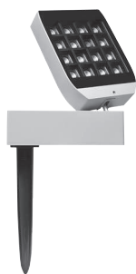
AC037 EARTH SPIKE