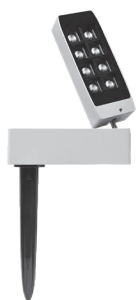
AC037 EARTH SPIKE