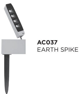
AC037 EARTH SPIKE