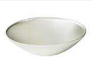
FLOOD 60° REFLECTOR (STANDARD)